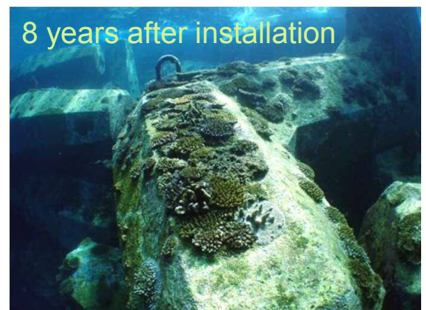
Figure 2 Field Experiment